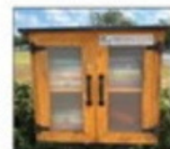
The Unitarian Universalist Congregation of Venice has a Little Free Library in its parking lot at 2300 Edmondson Road in Nokomis.

The UUCOV Little Free Library is open to the public year-round. Community members are encouraged to take a book, leave a book, and share the love of reading.